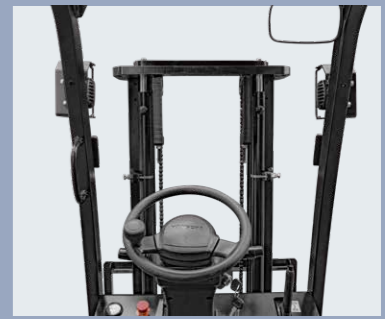
Wide view mast