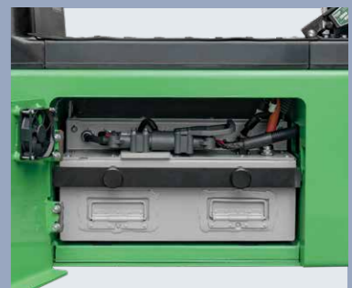
Lithium battery pack