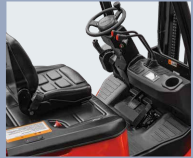
The truck is ergonomically designed to provide a good view and a large operating space