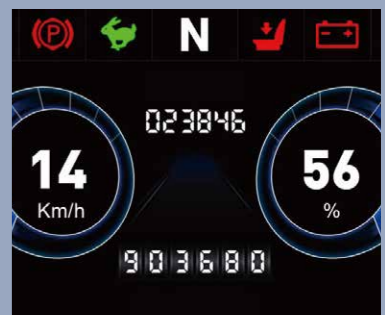
Multifunctional color screen instrument with graphical interface design is simple and intuitive for operator