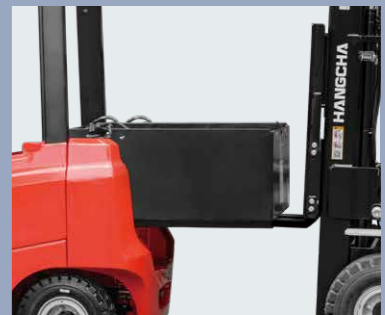
The battery can be removed from the rear enables the battery to be replaced more flexibly (Only for the lead-acid battery)