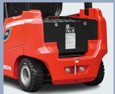
Battery is placed at the rear of the truck