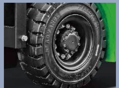
Standard rubber tread tires