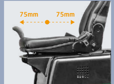
Seat can be adjusted backwards and forwards