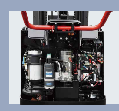
Back cover can be opened fully, and a components and parts are clear at a glance, which is very convenient for maintenance of the entire machine