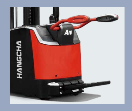
The integrated stamping molded guardra offers better protection for the operator