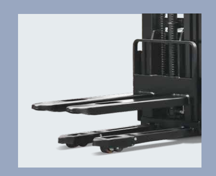
Tandem load whee