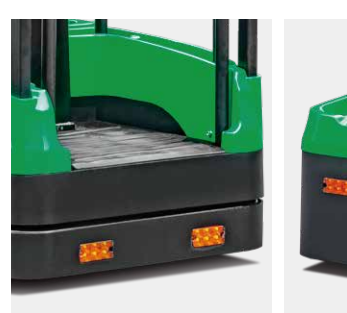
Front and rear flashing lights