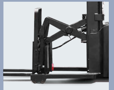
Forks move forward by the scissor structure