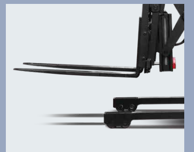
Proportional controlled forks can be operated more accurately