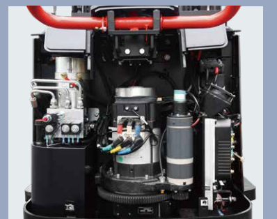
Back cover can be opened fully