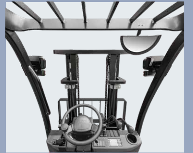
New designed mast and the large open steel roof provide super visibility, it also can reduce risk of accidents