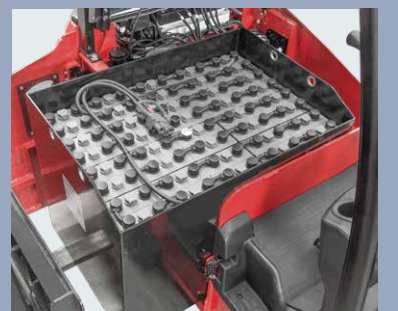
Side roll out the battery can provides the fast, simple and safe solution for the operator