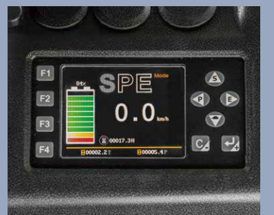
Multi-function instrument with color screen, clear human-computer interaction interface for visualized reading