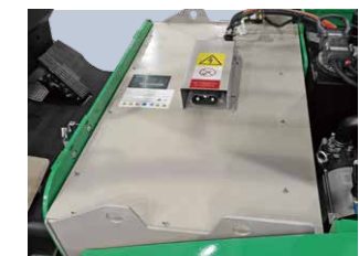
Lithium battery (Opt.)