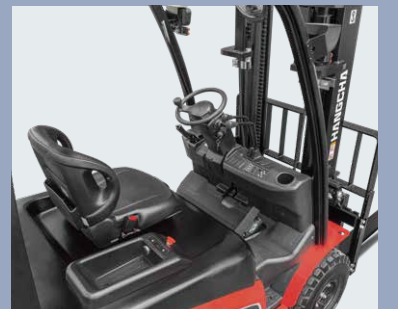
Fully closed operation plate space, tilting cylinder and flat bottom plate, providing more comfortable and safe operation