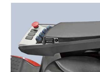
Fingertip system (Opt.)

Note: ● Battery Std. ○ Battery Opt. 2.5Lt:80V